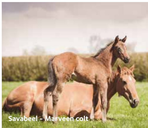
Savabeel - Marveen colt