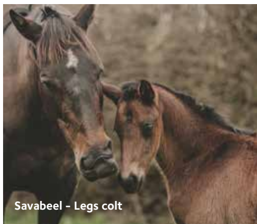
Savabeel - Legs colt