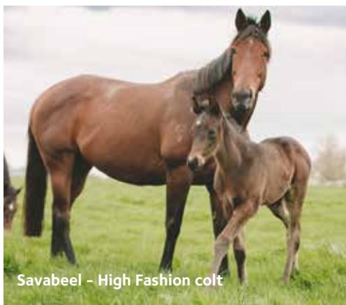
Savabeel - High Fashion colt