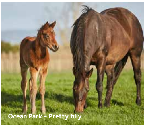
Ocean Park - Pretty filly