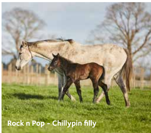
Rock n Pop - Chillypin filly