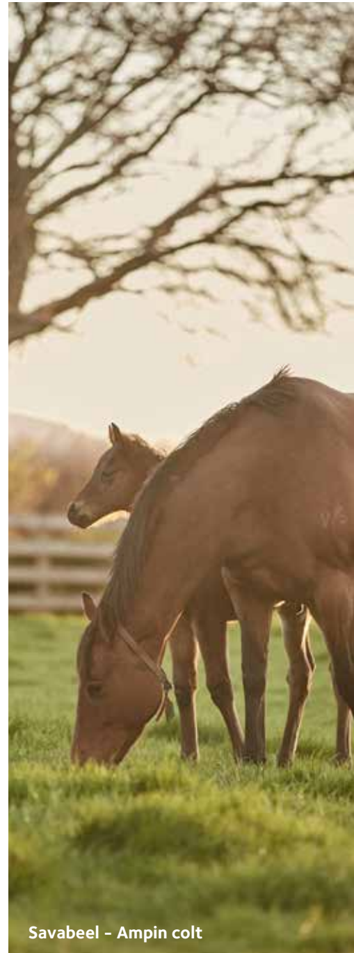
Savabeel - Ampin colt