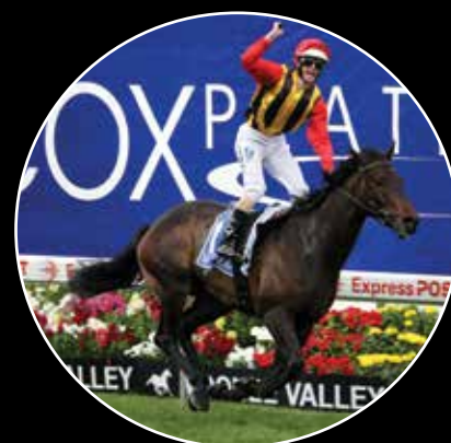
2007 EL SEGUNDO (Pins)