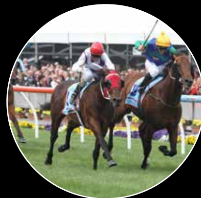
2012 OCEAN PARK