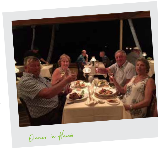
Dinner in Hawaii