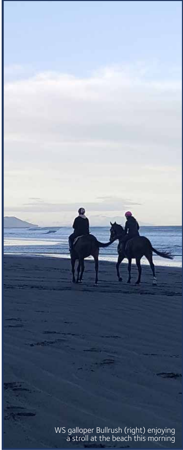
WS galloper Bullrush (right) enjoying a stroll at the beach this morning