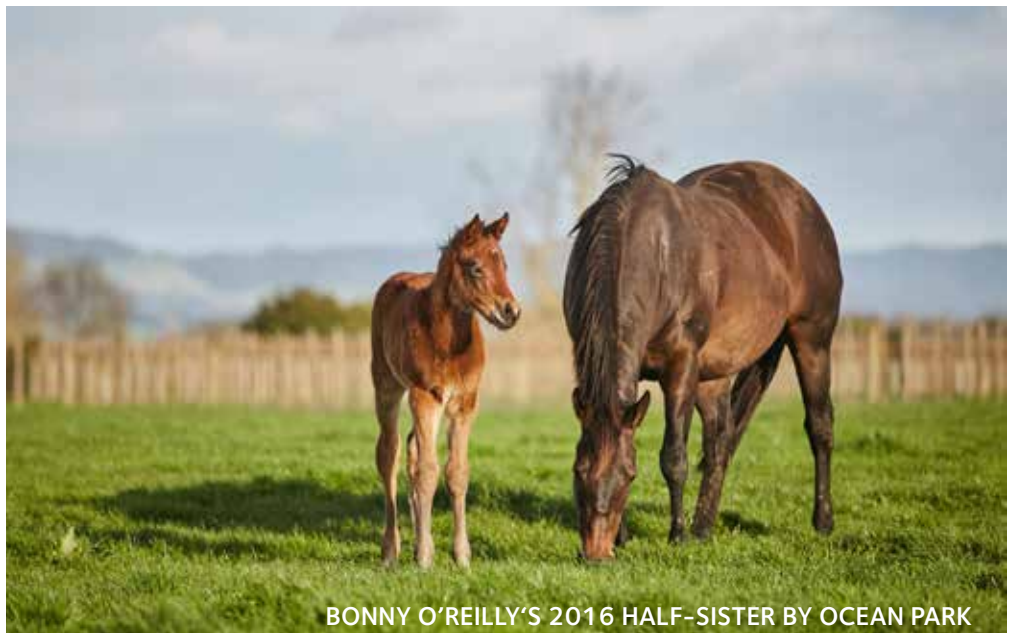
BONNY O'REILLY'S 2016 HALF-SISTER BY OCEAN PARK

Bonny O'Reilly was purchased out of WS's Premier Sale draft to Karaka in 2014 for $100,000. She is an O'Reilly daughter of the Pins mare Pretty, who is a half-sister to the top-flight winners Glamour Puss and Vision And Power.