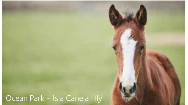
Ocean Park - Isla Canela filly