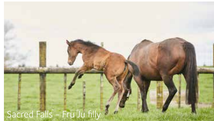
Sacred Falls - Fru Ju filly