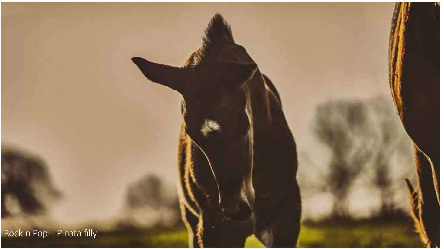
Rock n Pop - Pinata filly