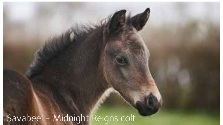
Savabeel - Midnight Reigns colt