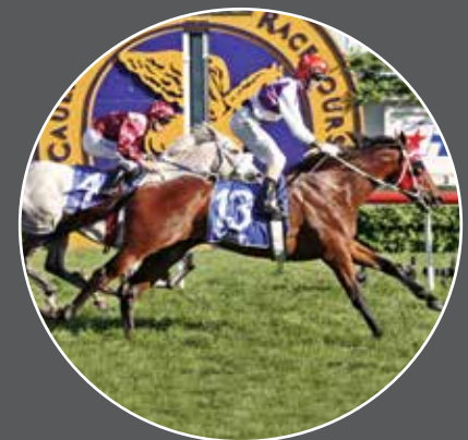
OCEAN PARK Thorn Park - Sayida 2012 Gr.1 Underwood Stakes

Namely, in completing Australia's G1 Underwood Stakes-Caulfield Stakes-Cox Plate treble, OCEAN PARK emulated the mighty deeds of champions AJAX, BONECRUSHER, ALMAARAD, NORTHERLY and SO YOU THINK.