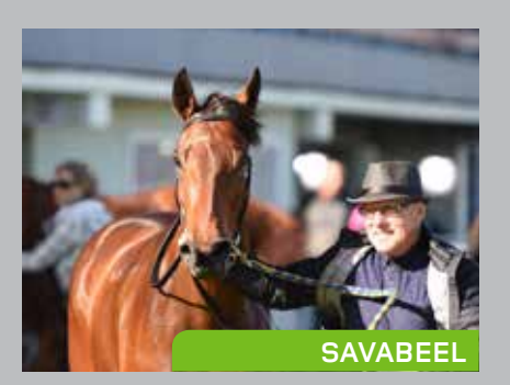
QUEEN OF ZEALAND

Aiming for Gr.1 Thousand Guineas at Caulfield