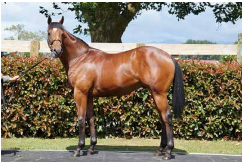
BOBO SO CUTE