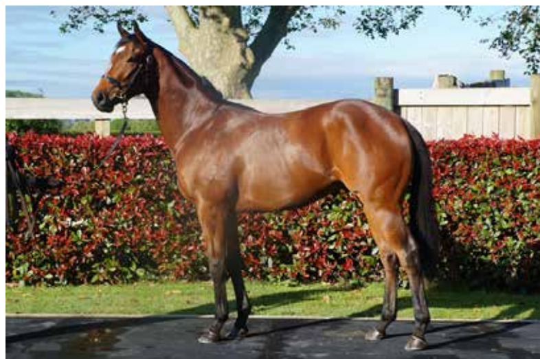
BOBO SO CUTE