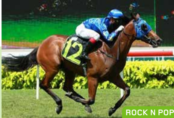
ROCK N POP