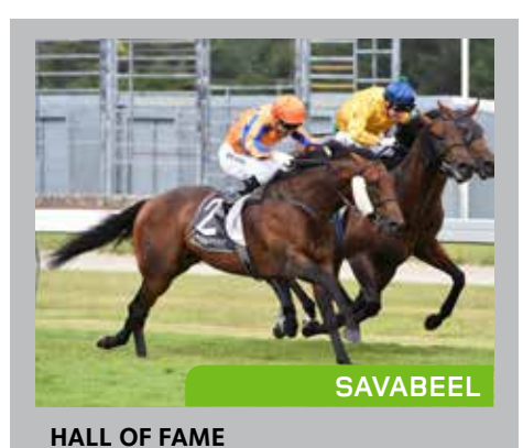
Te Akau's G1 winning colt has been purchased for a seven figure sum and will do his future racing in Hong Kong.