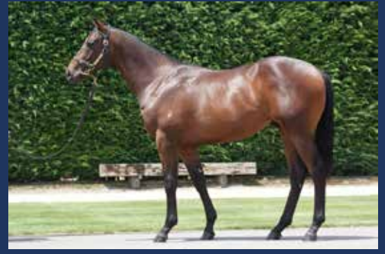
ADDICTIVE NATURE 14c Savabeel – Generous Nature Gr.3 Ming Dynasty 1400m AJC 5:05 pm (NZT)