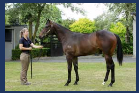
MAHALANGUR 14c O'Reilly - But Beautiful Gr.3 Ming Dynasty 1400m AJC 5:05 pm (NZT)