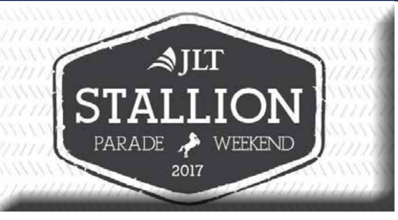
WAIKATO STUD COMMENCES ITS STALLION PARADE AT 10AM ON SATURDAY. ALL WELCOME!