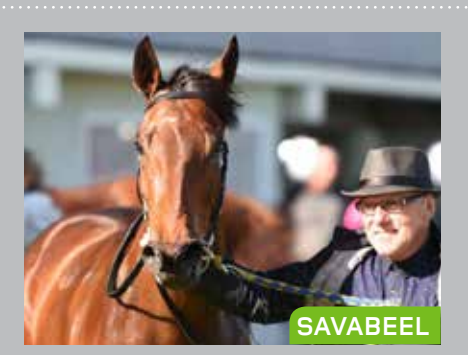
QUEEN OF ZEALAND

6 WINNERS THIS WEEK Nurse Kitchen Hall of Fame Savasava Coldplay The Grandson No Fuss