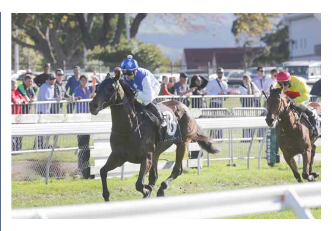
PUMP UP THE VOLUME (08g, Racing Is Fun).

Savabeel – Dita von Teese Listed Macau Gold Cup 1800m Macau, 8:50pm (NZT)