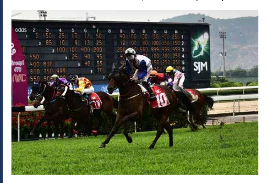
RIVER TREASURE (12g, Pins). This season's winner of the Macau Guineas L.

This season's winner of the CJC New Zealand Cup G3 and the Feilding Gold Cup L.