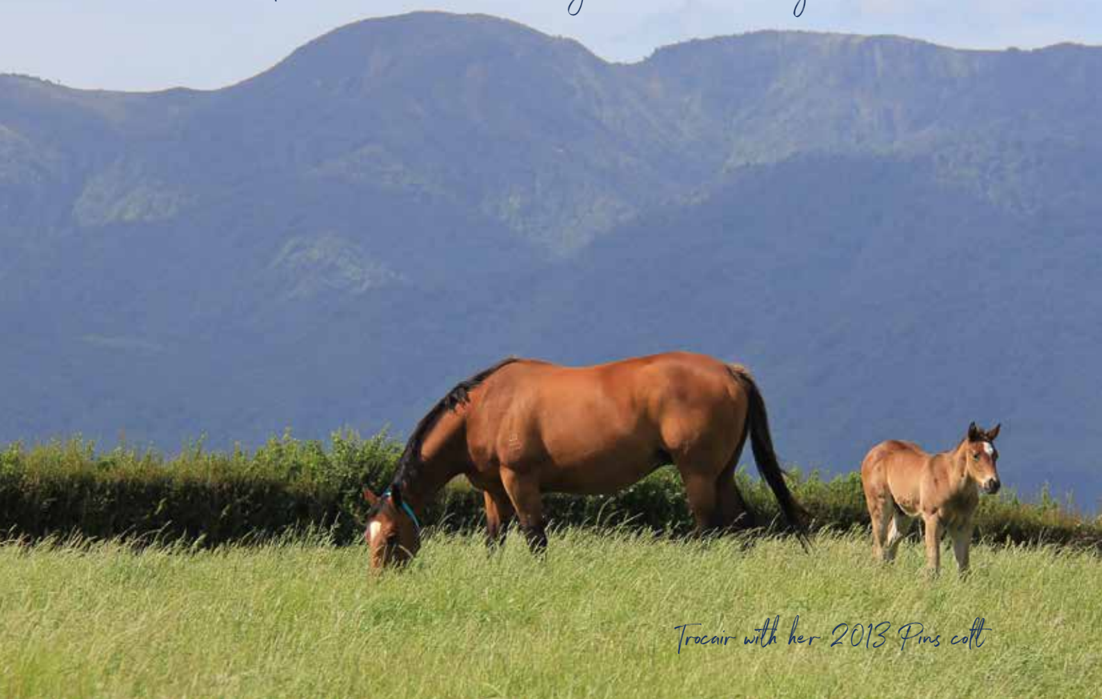
Trocair with her 2013 Pins colt