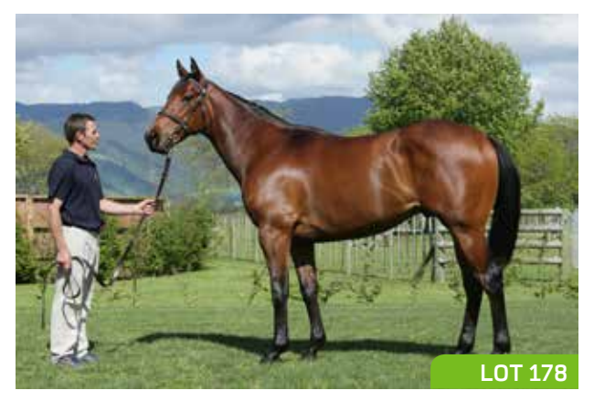
O'REILLY - DO RA MI GELDING Click here to see NZB information