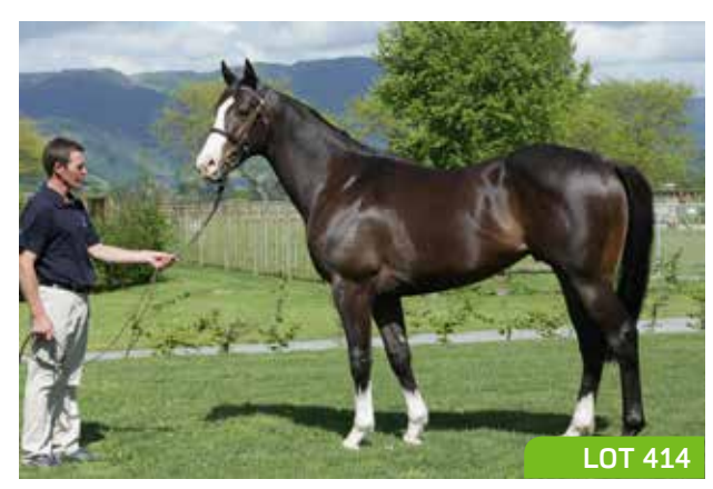
O'REILLY - PERLE NOIRE GELDING Click here to see NZB information

SAVABEEL - VILLIFYE COLT Click here to see NZB information