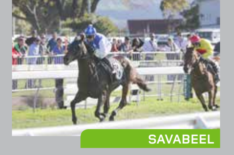
PUMP UP THE VOLUME Delivers the goods in the Listed Fielding Gold Cup