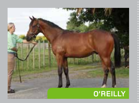
TRACEY'S STAR Debuted in Australia for immediate reward