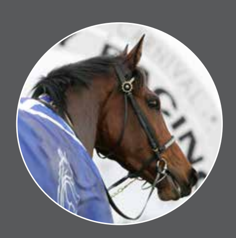
DAFFODIL 2009 Gr.1 Windsor Park Plate

Daffodil is currently in-foal to Savabeel and is due to foal at the end of October.