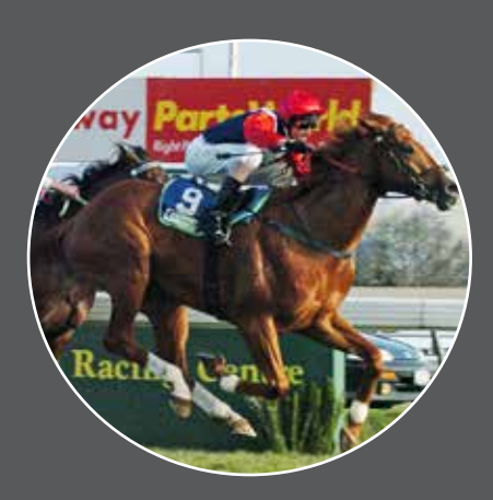
STARCRAFT 2004 Gr.1 Windsor Park Plate