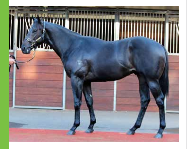
LOT 22 SAVABEEL - A REAL PRINCESS COLT Vendor: Lime Country