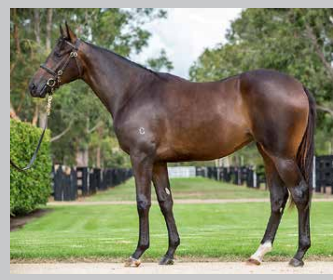
LOT 57 O'REILLY -BETTER ALTERNATIVE FILLY

Buyer: Meridian Int / Astute Bloodstoc $320,000