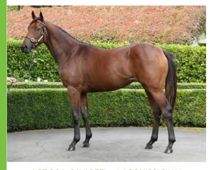
LOT 201 SAVABEEL - LAGONISSI FILLY