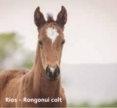
Rios - Rongonui colt