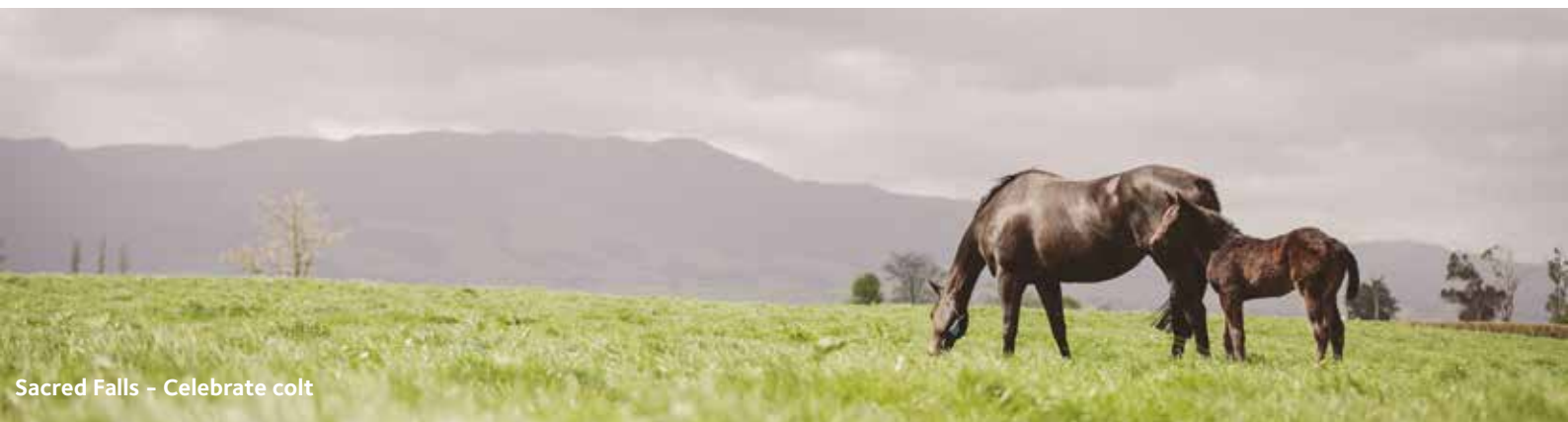
Sacred Falls - Celebrate colt