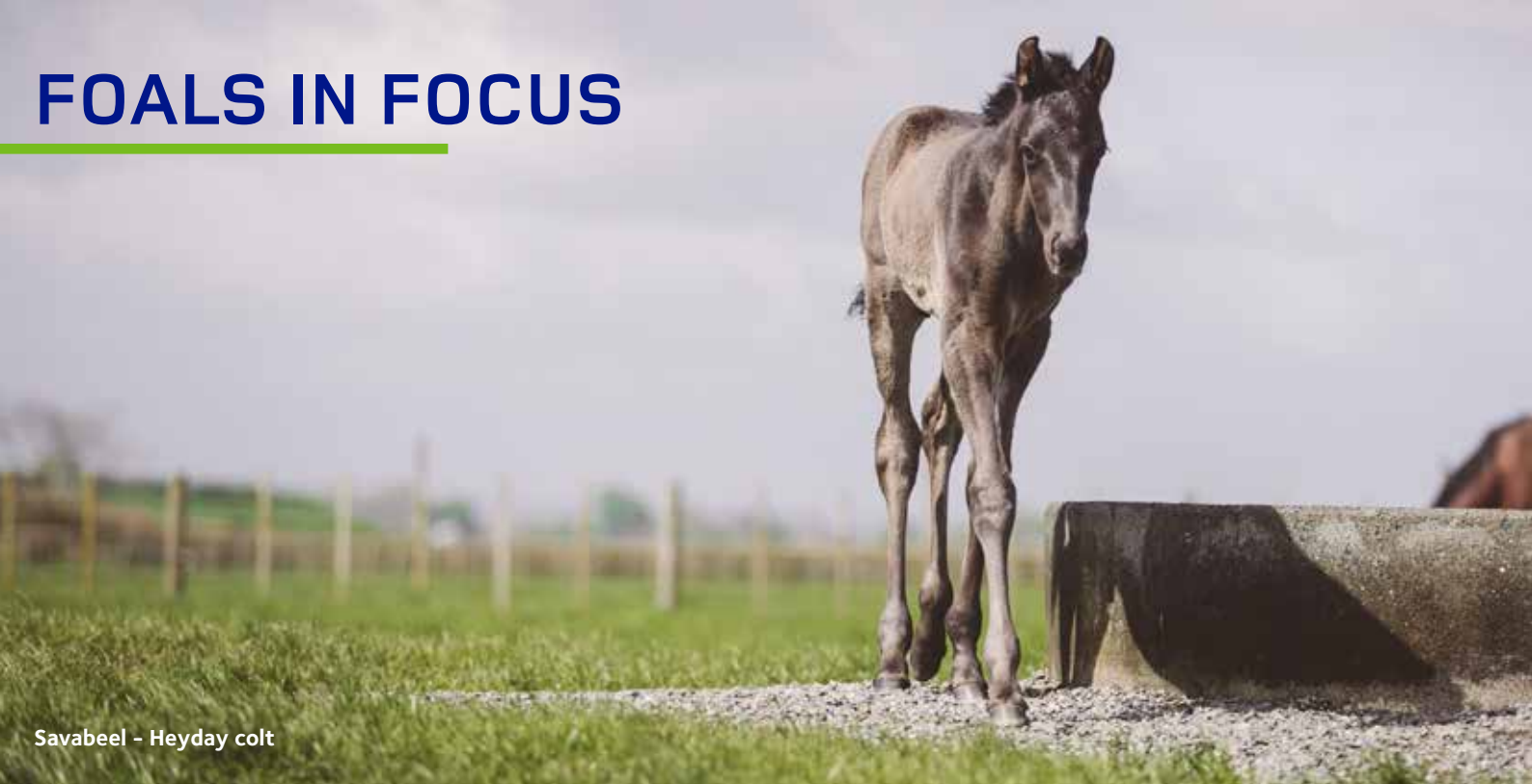
Savabeel - Heyday colt