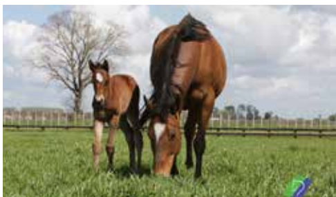
Christopher's black-type producing mare Trocair with Shillelagh at foot. Trocair is currently due to foal to Ocean Park.