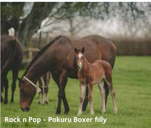
Rock n Pop - Pokuru Boxer filly