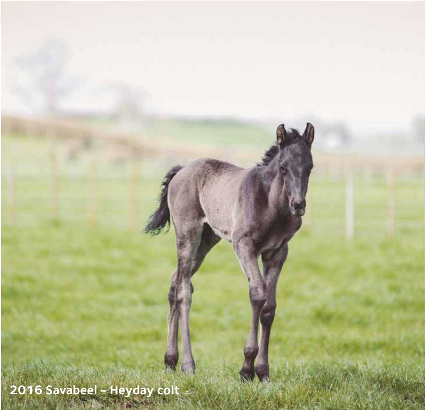
2016 Savabeel - Heyday colt