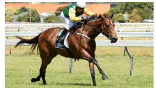
Trocair's black-type bound daughter Shillelagh.