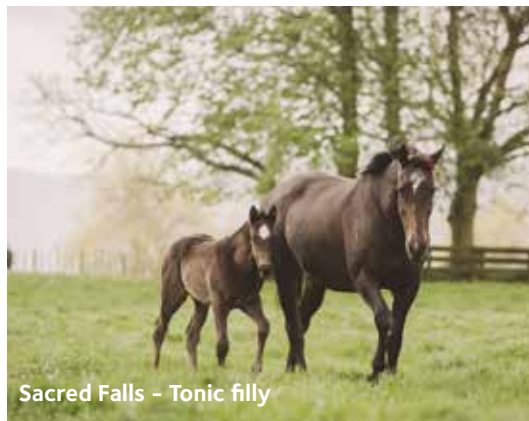
Sacred Falls - Tonic filly