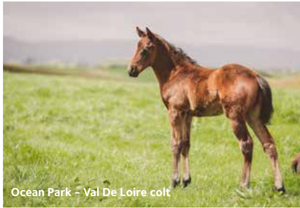
Ocean Park - Val De Loire colt