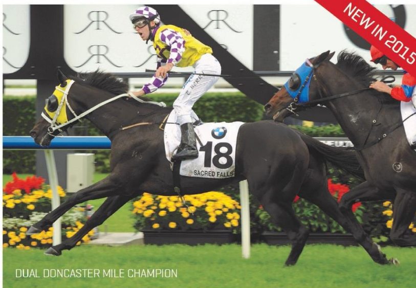
DUAL DONCASTER MILE CHAMPION

With additional G1 success in the George Main Stakes this season, he confirmed his place as Australia's leading miler and as the highest rated horse on the official handicaps at that time.