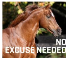
NO EXCUSE NEEDED