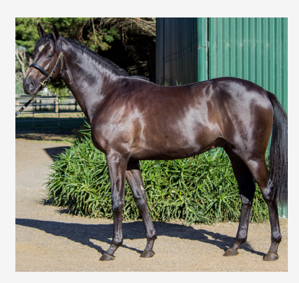
LOT 490 Sacred Falls - Lowland Colt Pedigree info