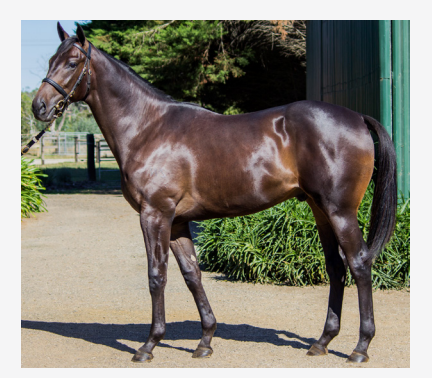
LOT 145 Savabeel - Girls On Top Colt Pedigree info