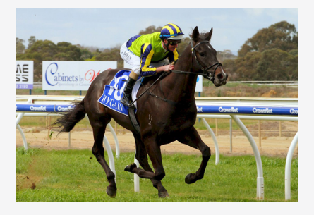
Rellson / By O'Reilly, from Honolulu