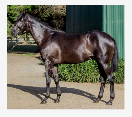
LOT 146 Savabeel - Heyday Colt Pedigree info