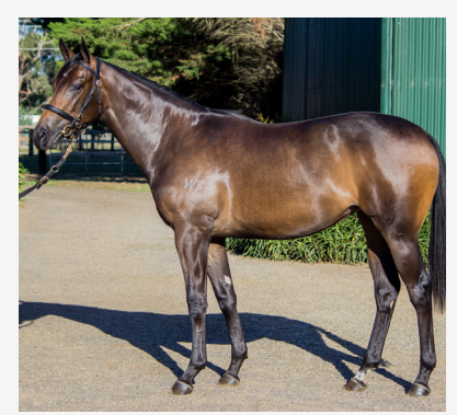
LOT 272 Ocean Park - Bird Filly Pedigree info