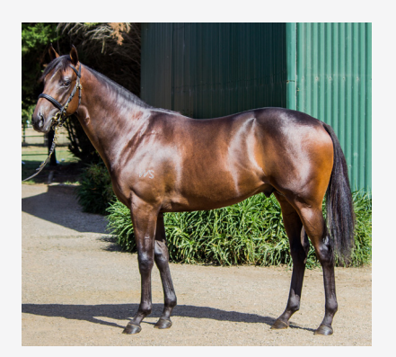
LOT 157 Savabeel - Natural Rhythm Colt Pedigree info