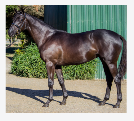
LOT 144 Savabeel - Frankly Filly Pedigree info