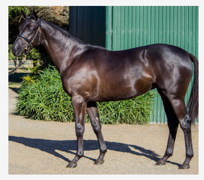
LOT 144 Savabeel - Frankly Filly