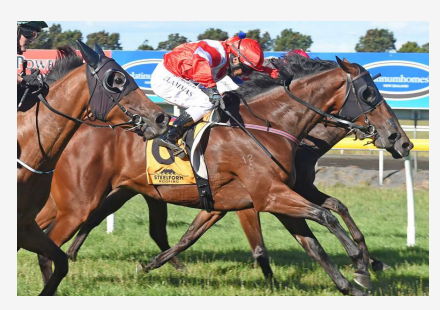
Mongolianconqueror / By Ocean Park, from Queen Rania