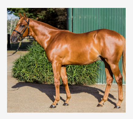
LOT 44 Pins - Romancing Colt