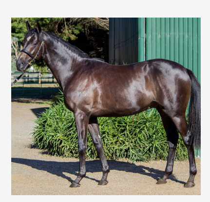
LOT 490 Sacred Falls - Lowland Colt