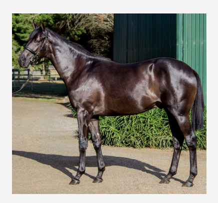
LOT 146 Savabeel - Heyday Colt