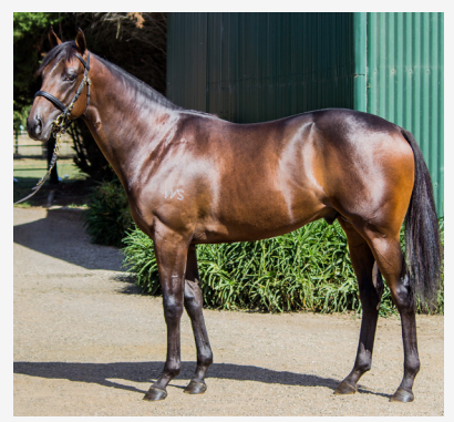
LOT 157 Savabeel - Natural Rhythm Colt