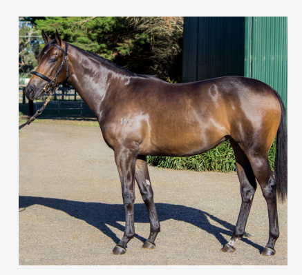
LOT 272 Ocean Park - Bird Filly