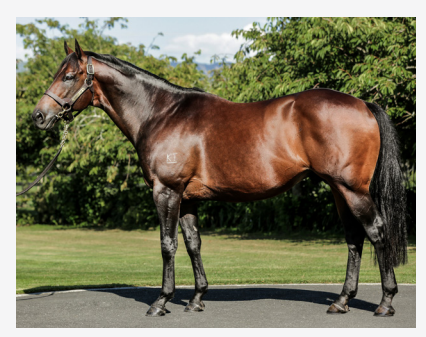
ROCK 'N' POP

Group One-winning blueblood Service Fee $9,000+gst LFG