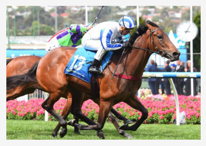
Nurse Kitchen / By Savabeel, from Flying Monty

Kris Lees trained Savabeel mare Nurse Kitchen is making her comeback to the racetrack following a 12-month break. Purchased by the China Horse Club for $1.7 million at the 2017 Magic Million broodmare sale, Nurse Kitchen will look to make her comeback in tomorrow's Group 3 Dark Jewel Classic over 1400m.