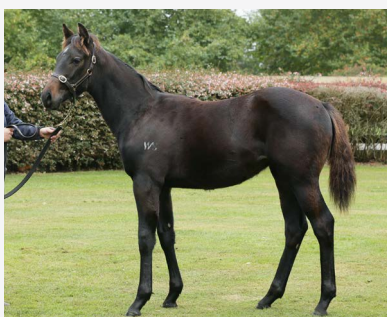
LOT 345 Rock 'n' Pop - Tricilo Filly