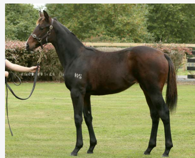
LOT 162 Ocean Park - Former Glory Filly Pedigree info