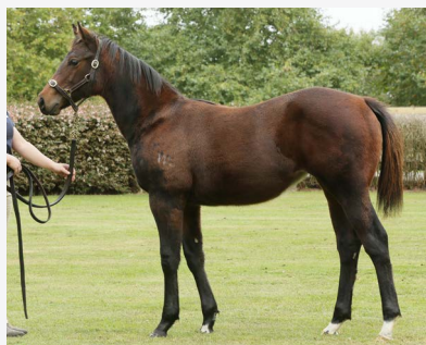
LOT 321 Ocean Park - Sofia Loren Filly