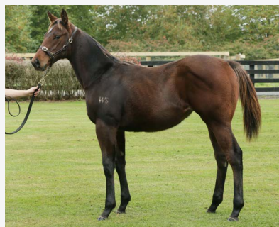
LOT 179 Sacred Falls - Head Spin Filly Pedigree info