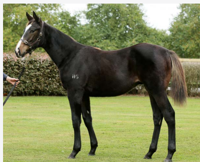
LOT 101 Sacred Falls - Breezy Colt Pedigree info

Waikato Stud are proud to present 13 weanlings by some of Australasia's finest stallions Pins, Ocean Park, Sacred Falls and Rock 'n' Pop.