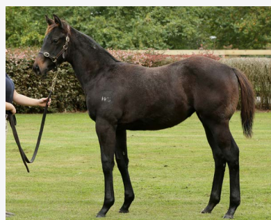
LOT 354 Rock 'n' Pop - Vanilla Sky Filly