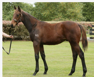
LOT 192 Rock 'n' Pop - I Que Colt Pedigree info