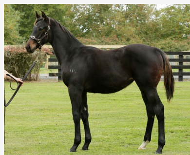
LOT 295 Ocean Park - Really Reputable Filly