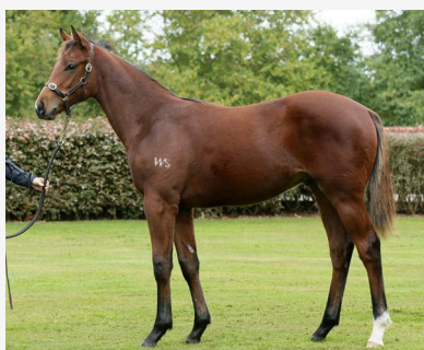
LOT 184 Ocean Park - Hope So Colt Pedigree info