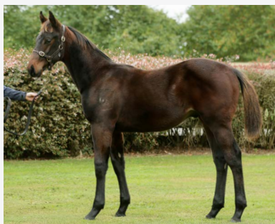
LOT 120 Ocean Park - Congér Colt Pedigree info