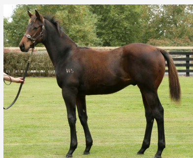
LOT 358 Ocean Park - We Love Colt