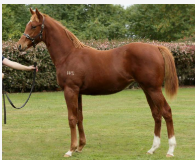
LOT 256 Pins - Onesey Filly