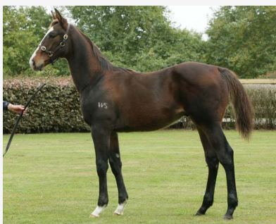
LOT 250 Sacred Falls - Neversaynever Colt