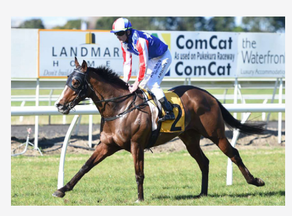
Taurus / By No Excuse Needed, from Stars in Her Eyes