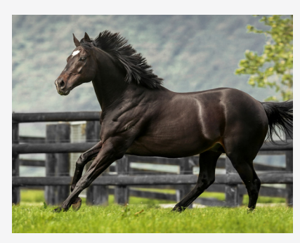
SACRED FALLS Leading First Season Sire at Karaka in 2018 SERVICE FEE: $30,000+gst LFG