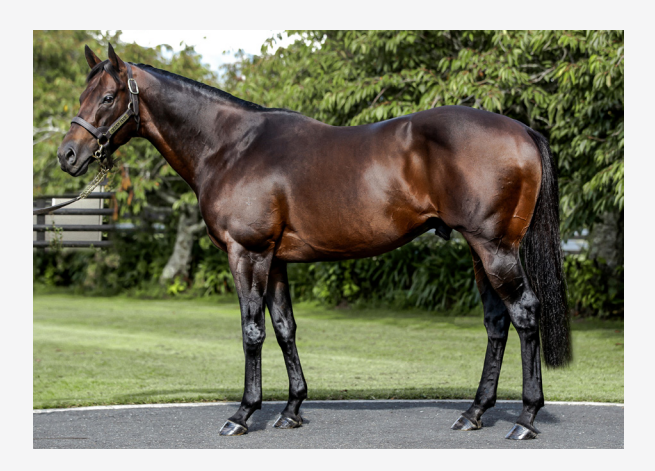
By Thorn Park, from Sayyida (by Zabeel) 16 hh | 2008 | Bay

As a mid-season three-year-old Ocean Park won the Wellington Stakes Gr.3 before his first Australian preparation produced a close second in the Rosehill Guineas, Gr.1. Ocean Park finished his career in the autumn of his four-year-old season with eight wins and $2.8 million in stake earnings.