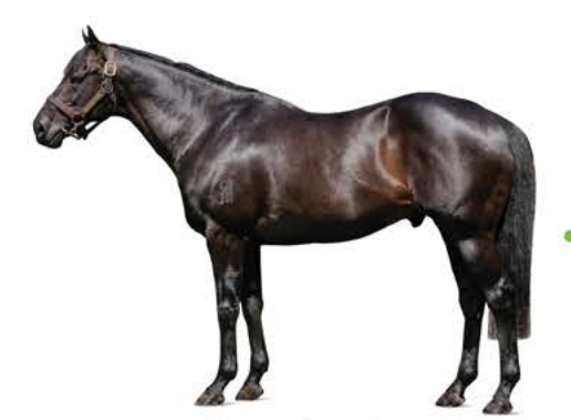
Savabeel SERVICE FEE Private