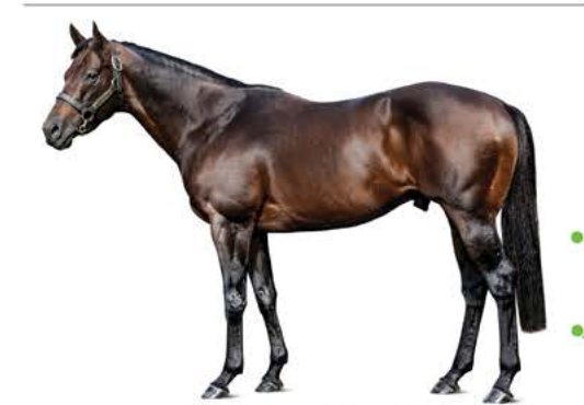
Ocean Park SERVICE FEE $30,000+gst LFG