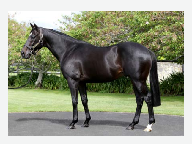
By O'Reilly, from Iguazu's Girl (by Redoute's Choice) 15.3 hh | 2009 | Brown

A 100 per cent homebred being by the Waikato Stud homebred Champion Sire O'Reilly, Sacred Falls boasts an impressive maternal pedigree being a daughter of the winning Redoute's Choice mare Iguazu's Girl from a family laden with group winning names such as Splashing Out, Shopaholic, Splurge, Omnicorp, Crimson, Pharostan and