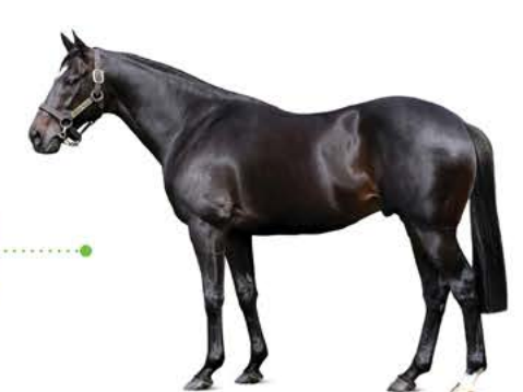
Sacred Falls SERVICE FEE $30,000+gst LFG