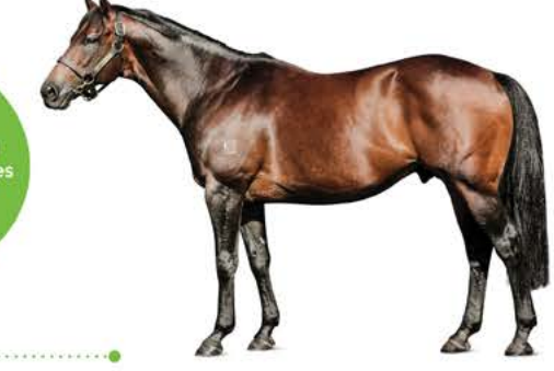
Rock 'n' Pop