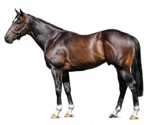
Tivaci service fee $20,000+gst LFG