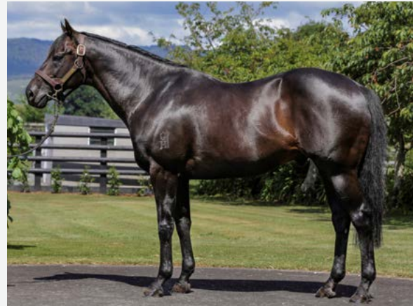
By Zabeel, from Savannah Success (by Success Express) 16hh | 2001 | Brown | Service Fee Private

With recent successes, Savabeel is now achieving a Stakes winners-to-runners ratio above 10 per cent and has thus become only the second sire currently standing in Australasia to reach that level of excellence. Savabeel also boasts an enviable winners-from-runners ratio that exceeds 70 per cent.