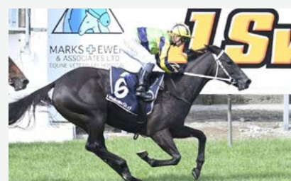
Santa Catarina / By Savabeel, from Discreet Evening