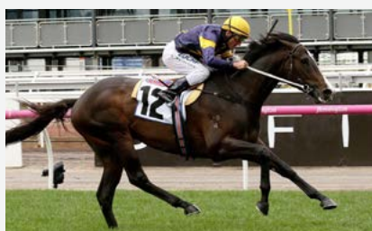
Grunt / By O'Reilly, from Ruqqaya

Grunt returned to winning form in the Group 1 Makybe Diva Stakes at Flemington last start when powering away from his opposition. The four-year-old O'Reilly entire heads back to Caulfield this week in the $750,000 Group 1 Underwood Stakes over 1800m on Sunday as a stepping stone towards the Cox Plate. He meets a similar line up and given luck in running, he is among the leading chances.