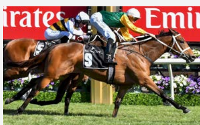
Shillelagh / By Savabeel, from Trocair