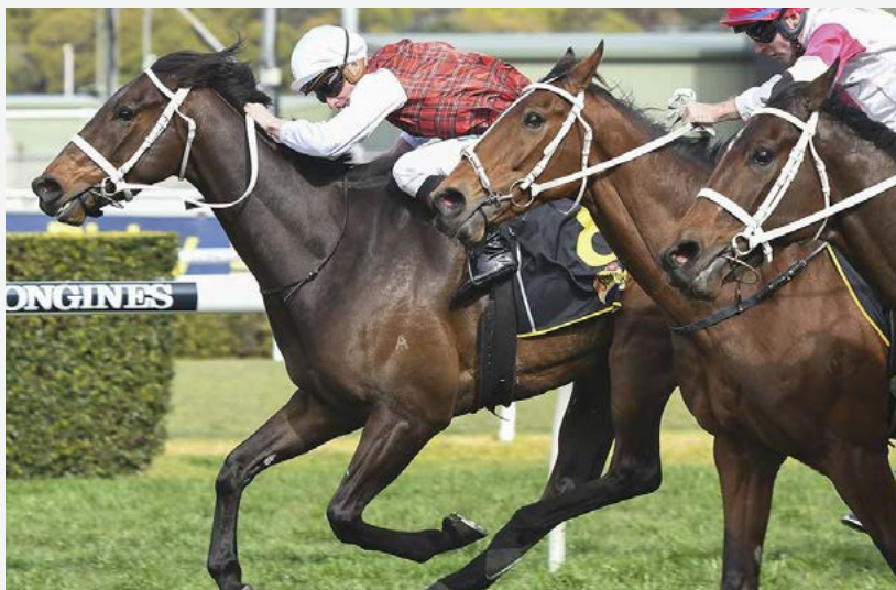
The Lord Mayor / By Rock 'n' Pop, from Soph