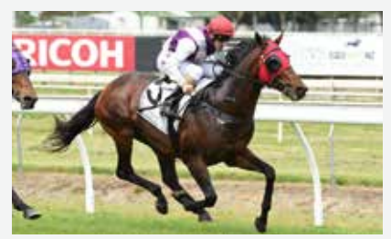
Ocean Emperor / By Zabeel, from Tootsie