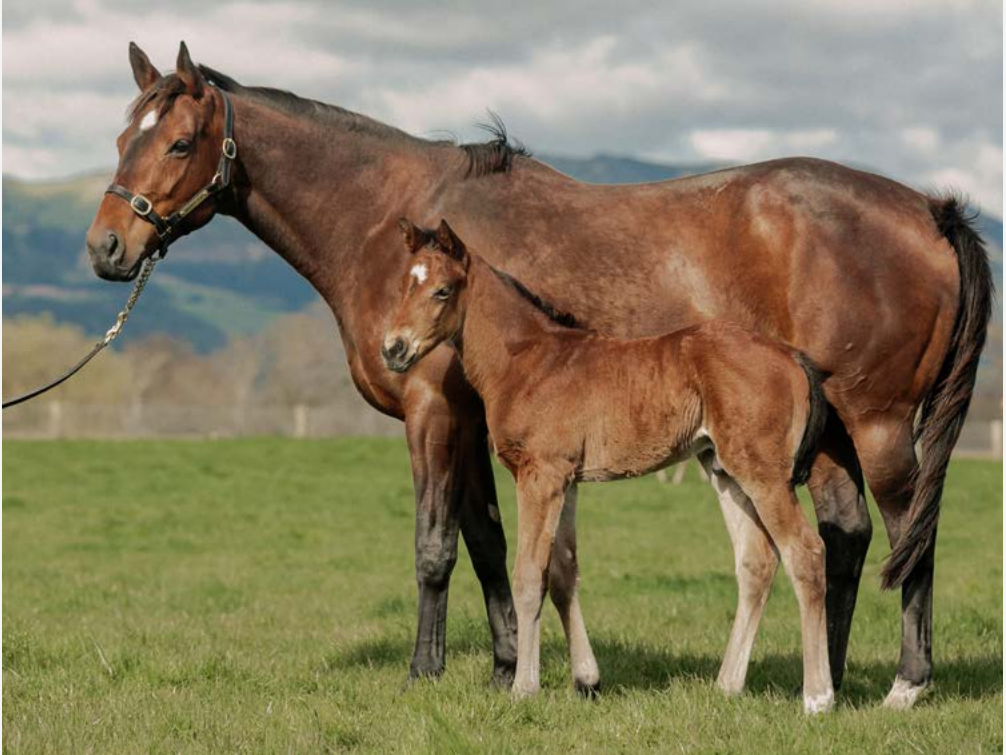
о авоvе / Tivaci -Oahu colt