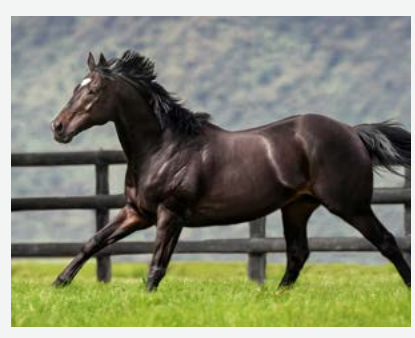
SACRED FALLS Leading First Season Sire at Karaka in 2018 SERVICE FEE: $30,000+gst LFG