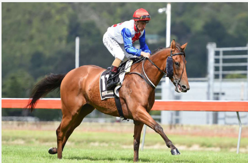
Savvy Coup / By Savabeel, from Eudora

The dual Group 1 winning Savabeel mare takes on the best in the world in the Group 1 Cox Plate at Moonee Valley. Bred by Waikato Stud, she couldn't have been more impressive winning the Livamol Classic last start over the same distance. She needs to take another step up taking on Winx, Benbatl, Humidor etc but she has earned her chance. We wish her connections all the very best!