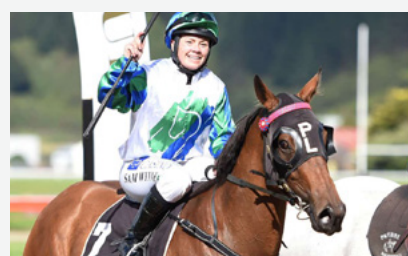
Flamingo / By Pins, from Bird

Fitter for having three runs back from a spell, the Waikato Stud bred/raced daughter of Pins lines up in the Group 3 Thompson Handicap over 1600m at Trentham. She has a very good record at the course/distance and a win here would add considerable value to her as a future broodmare, being a half-sister to Singapore Stakes winner Preditor. Her opposition includes five-year-old mare Savabeel mare Fawn.