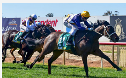
Savvy Oak / By Savabeel, from Fairy Oak