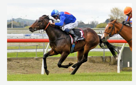
Masque / By Savabeel from Disguised

The WS-bred son of Savabeel takes another step towards a possible start in the NZ Derby when he takes his place in the Listed Barfoot & Thompson 3YO Salver at Ellerslie on Sunday. Although he hasn't won this preparation, he continues to race consistently and looks well suited stepping up to 2100m. His opposition includes fellow Savabeel colt Prince Albert and Rock 'n' Pop gelding Desirabull.