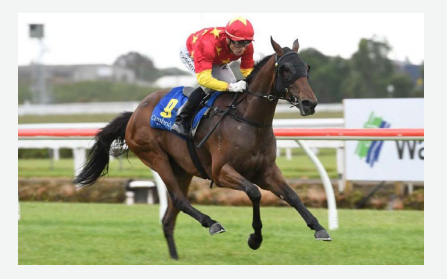
Queen of Diamonds / By Savabeel from Love Diamonds

The very well bred three-year-old daughter of Savabeel couldn't have been more impressive when breaking her maiden last start by just under five lengths. She takes her place in the $70,000 Group 3 Eulogy Stakes at Awapuni. Drawn the inside barrier, she should be given a soft run throughout and looks one of the main chances. Her opposition includes fellow Savabeel filly Elate and WS bred O'Reilly filly Just Fabulous.