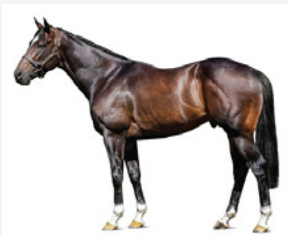
A nomination to Tivaci valued