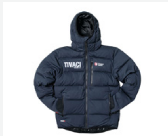
A limited edition Stoney Creek jacket