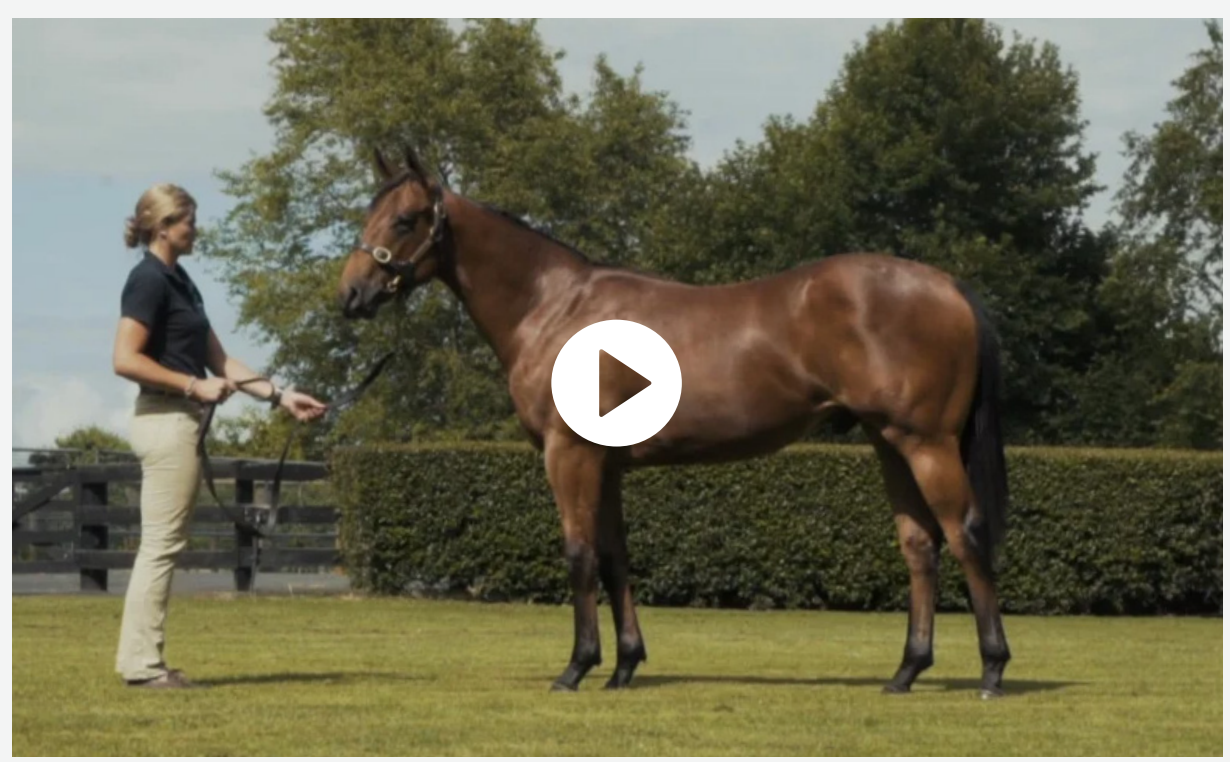
Ocean Park - Eudora Colt