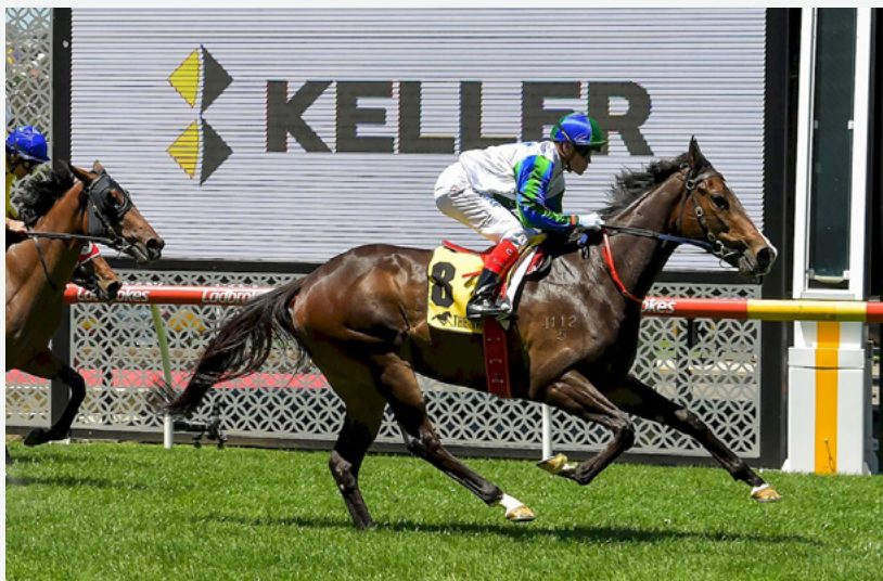
My Pendant / By Pins, from My Locket