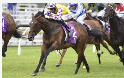
Surely Sacred / By Rock 'n' Pop, from Hope So