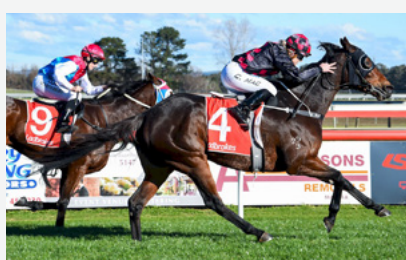
Excessabeel / By Savabeel, from Royal Excess