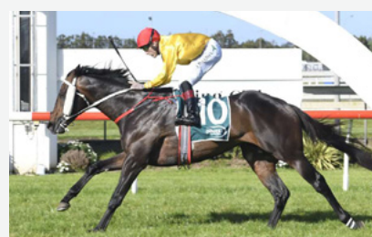
Vername / By O'Reilly, from Bohemian Blues