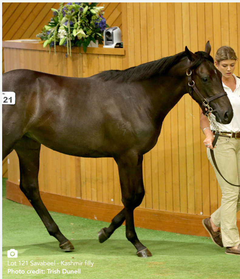
Lot 121 Savabeel - Kashmir filly

"The pedigree is a filly's pedigree. All round I thought she was a beautifully balanced filly who has every chance of doing the job that we have bought her for."