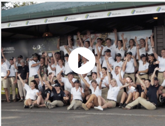
It's that champion feeling again!

We've produced a collection of videos to give you an insight as to what goes on behind the scenes at Karaka.