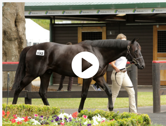
Savabeel colt smashes Karaka record