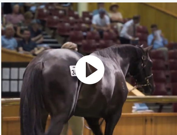
Karaka Day Three Wrap Up