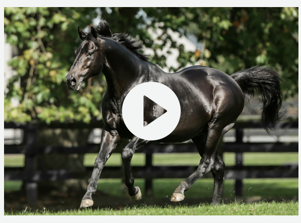
We're ready, are you?