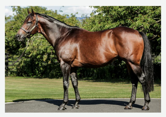
ROCK 'N' POP Multiple Stakes Producer SERVICE FEE: TBC