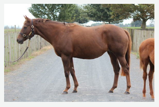
LOT 69 - RAVELIN