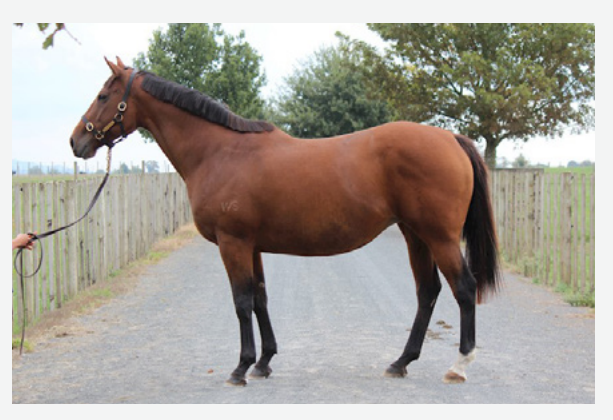
LOT 51 - FIORITA