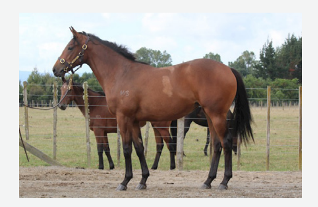
LOT 21 - OCEAN PARK FILLY

Waikato Stud are offering a number of horses on this week's online Gavel House auction.