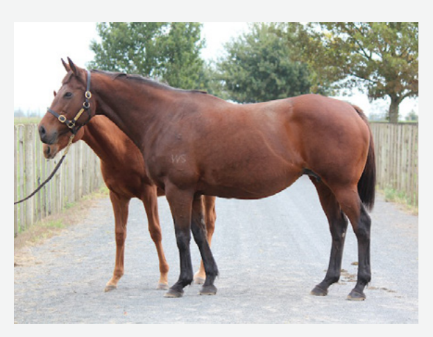
LOT 71 - ROSE RED