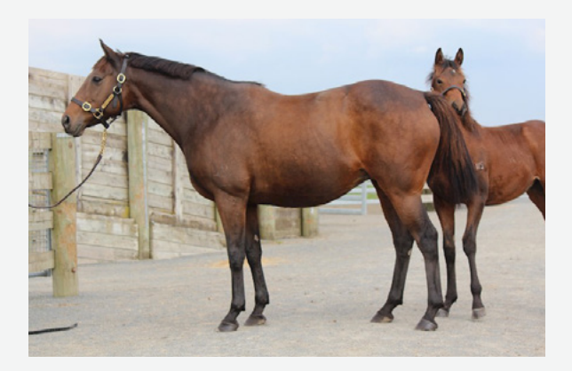
LOT 68 - RANSOM SUCCESS