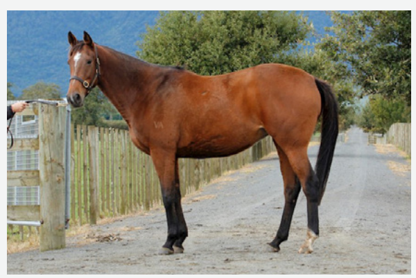
LOT 62 - MAYTRA DEE