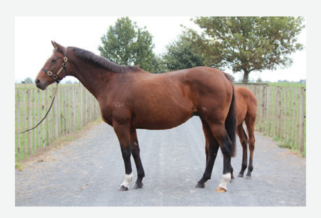
LOT 59 - LIGHTNING SPUR