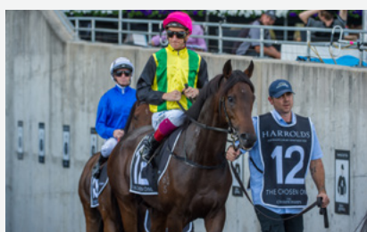
The Chosen One / By Savabeel, from The Glitzy One