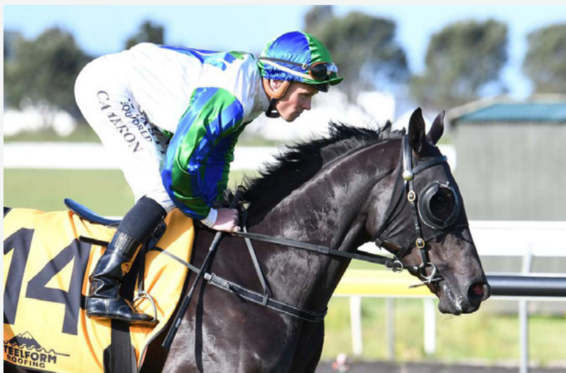
Ignored / By Savabeel, from She's Snubbed