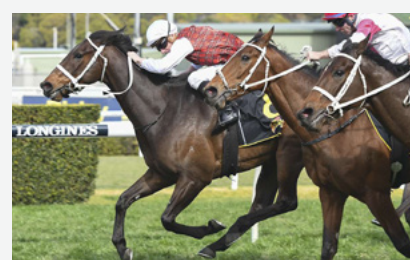
The Lord Mayor / By Rock 'n' Pop, from Soph