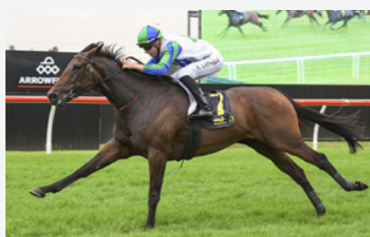
On the White Turf / By Savabeel, from Pins on Ice