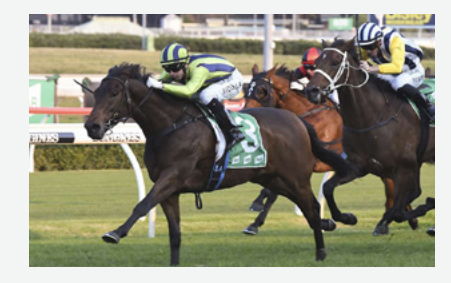
Live and Free / By Savabeel, from Patrimonium