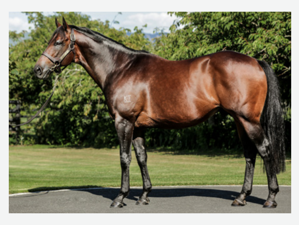
ROCK 'N' POP