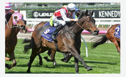
(Our) Libretto / By O'Reilly, from Etoile du nord

The five-year-old daughter of O'Reilly finished off her last race strongly and will no doubt be fitter from the run. She won at Caulfield two starts back and should relish the 'good' track conditions. She has an excellent record on good tracks, winning all five of her career starts on this surface. She has unfortunately drawn a horror gate out in barrier 19 but hopefully, jockey Jamie Kah can ride her positively and find a good spot.