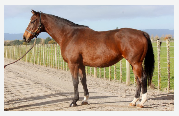
LOT 50 | MORE TO LOVE BROODMARE | IN FOAL

Five time winning Pins mare in foal to the dual Doncaster winner Sacred Falls with a 27th September LSD.