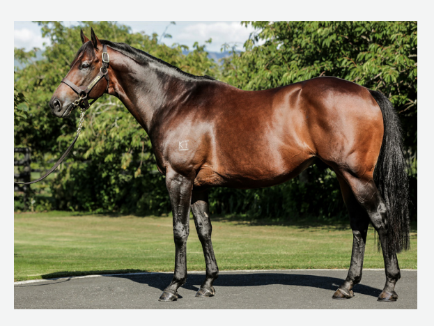
ROCK 'N' POP

Multiple Stakes Producer SERVICE FEE: $7,000 + GST LFG