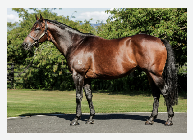
ROCK 'N' POP

Multiple Stakes producer SERVICE FEE: $7,000 + GST LFG