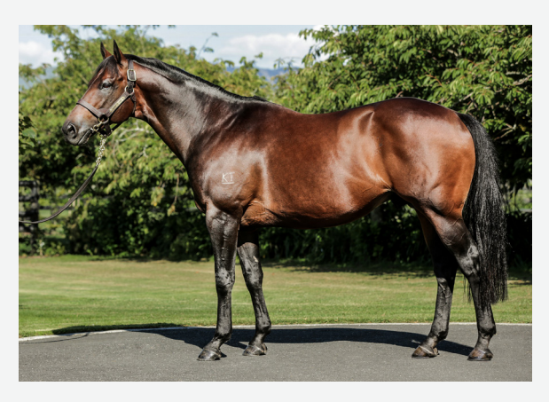
ROCK 'N' POP

Multiple Stakes producer SERVICE FEE: $7,000 + GST LFG