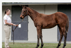
LOT 11 Kermadec - Handpicked colt