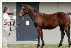
LOT 23 Ocean Park - On Parade colt