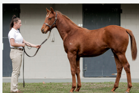
LOT 21 Ocean Park - Nadel Dame filly