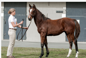
LOT 2 Tivaci - Black Belt colt