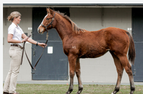
LOT 22 Sacred Falls - Neversaynever filly