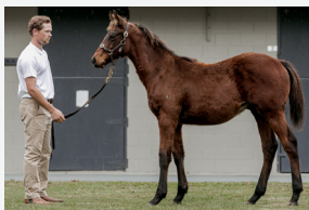
LOT 6 Ocean Park - Curvy colt