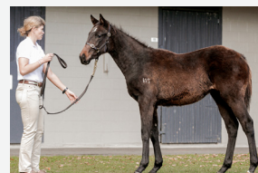
LOT 26 Sacred Falls - Quizzical filly colt