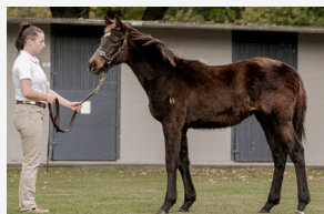
LOT 3 Sacred Falls - Capinsky filly