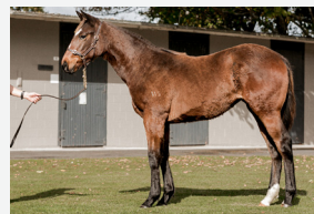
LOT 5 Tivaci - Corsicana filly