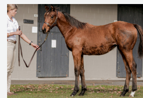
LOT 9 Sacred Falls - Frockstar filly