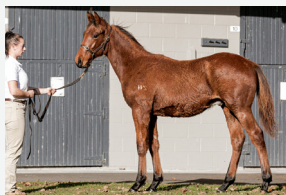
LOT 16 Ocean Park - Light Bulb colt