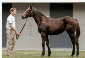
LOT 7 Sacred Falls - Flutter filly