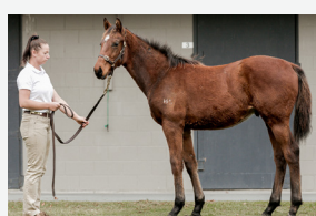
LOT 33 Ocean Park - Tricilo colt