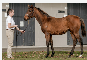
LOT 27 Pins - Really Reputable filly