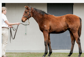
LOT 10 Ocean Park - Girls on Top colt