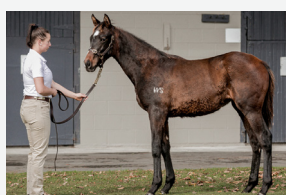
LOT 28 Sacred Falls - Sharbeela filly