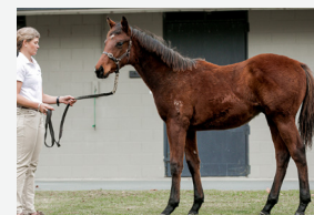
LOT 13 Ocean Park - Is This Love colt