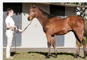
LOT 8 Tivaci - Forfrocksakes colt