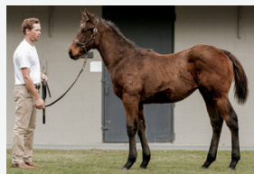
LOT 4 Tivaci - Celebrate colt