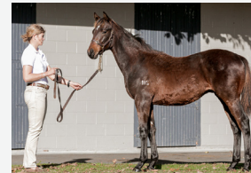
LOT 19 Ocean Park - Miss Motown colt