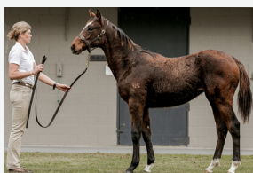
LOT 14 Sacred Falls - Lady Pentire filly