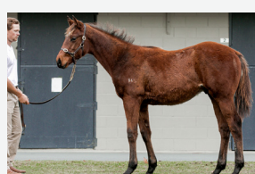
LOT 34 Ocean Park - We Love colt