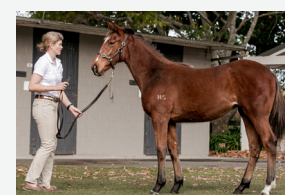
LOT 32 Sacred Falls - The Fascinator filly