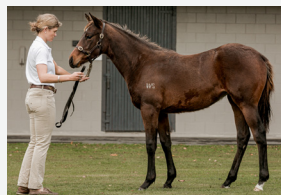
LOT 18 Sacred Falls - Miss Caruso filly