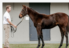
LOT 12 Ocean Park - Hope So colt