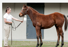
LOT 29 Ocean Park - Sofia Loren filly