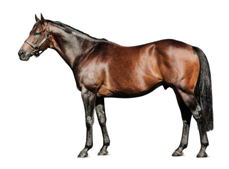
Rock 'n' Pop