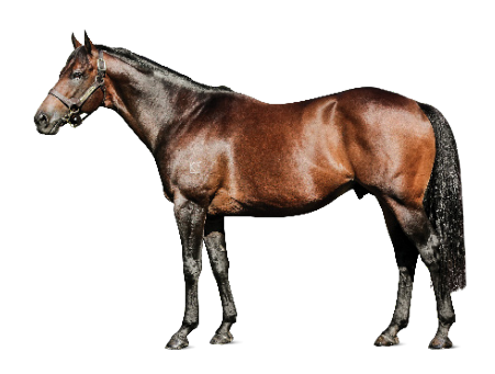
Rock 'n' Pop