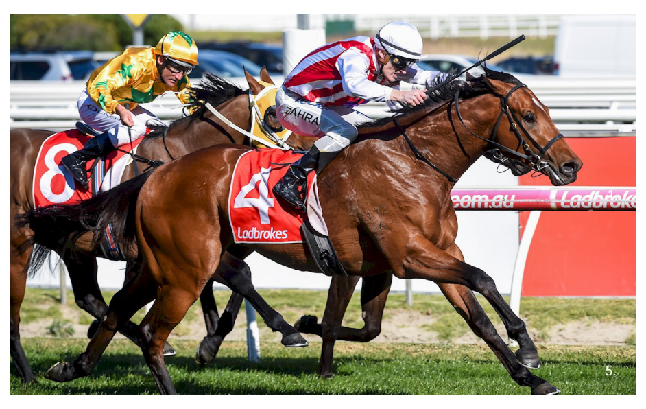
Carnival success: 1. Acting (Savabeel) 2. Oceanex (Ocean Park) 3. Banquo (Written Tycoon) 4. Tofane (Ocean Park) 5. Super Seth (Dundeel)