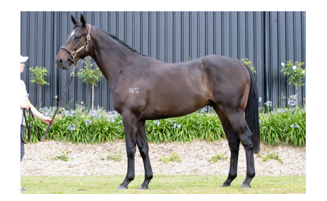
LOT 383 Sacred Falls - Flutter Colt Breeze up time: 10:67

WAIKATO STUD WILL OFFER 12 TWO-YEAR-OLD'S AT NEXT WEEK'S NZB READY TO RUN SALE. THEY WILL BE PRESENTED IN THE DRAFT OF TOP READY TO RUN COSIGNORS OHUKIA LODGE AND WILL BE AVAILABLE TO VIEW FROM 09:00AM SUNDAY NOVEMBER 17 IN BARN H.