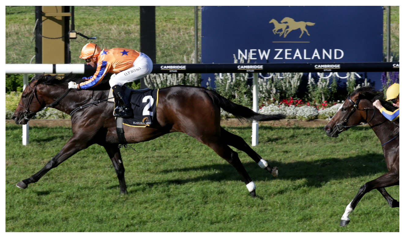
> Continued on next page

Below: Cool Aza Beel claims the Karaka Million 2YO