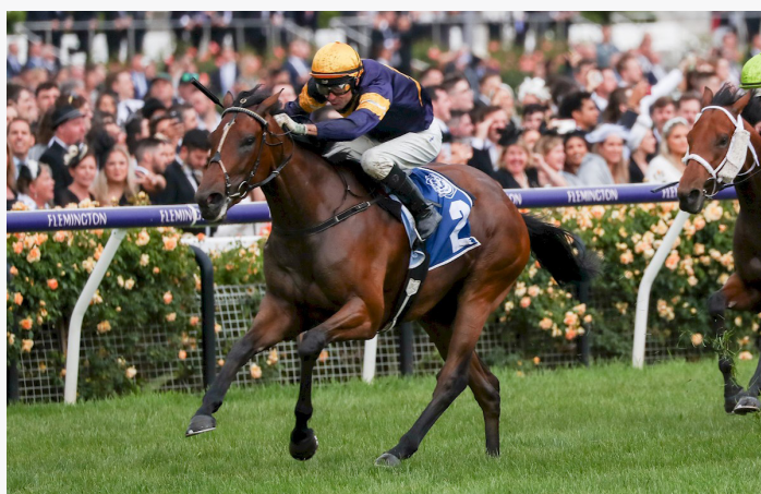
Tofane (Ocean Park x Baggy Green) Gr.1 Newmarket Hcp

The WS part-owned colt returns to the scene of his Listed Springtime Hcp (1400m) success this Saturday in a quest to add Gr.1 stallion credentials to his name.