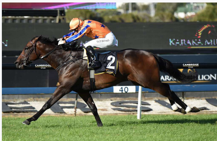
Cool Aza Beel (Savabeel x Cool 'n' Sassy) Gr.1 Sistema Stakes