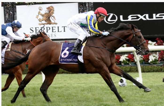
Banquo (Written Tycoon x Noondie) Gr.1 Newmarket Hcp

The WS part-owned colt returns to the scene of his Listed Springtime Hcp (1400m) success this Saturday in a quest to add Gr.1 stallion credentials to his name.