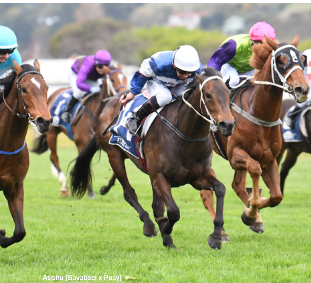
Atishu [Savabeel x Posy]