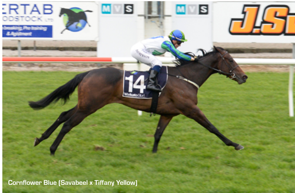
Cornflower Blue (Savabeel x Tiffany Yellow)

The Waikato Stud-bred and raced Cornflower Blue remains very much in the picture for next month's G1 Barneswood Farm New Zealand 1000 Guineas.