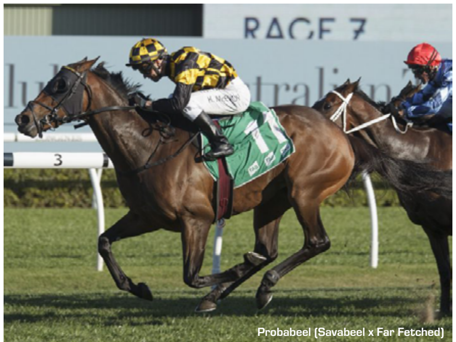
Probabeel (Savabeel x Far Fetched)

WAIKATO STUD- BRED MARE PROBABEEL FURTHER EMPHASISED HER STAR QUALITIES WITH A STUNNING VICTORY IN THE G1 EPSOM HANDICAP AT RANDWICK ON OCTOBER 3