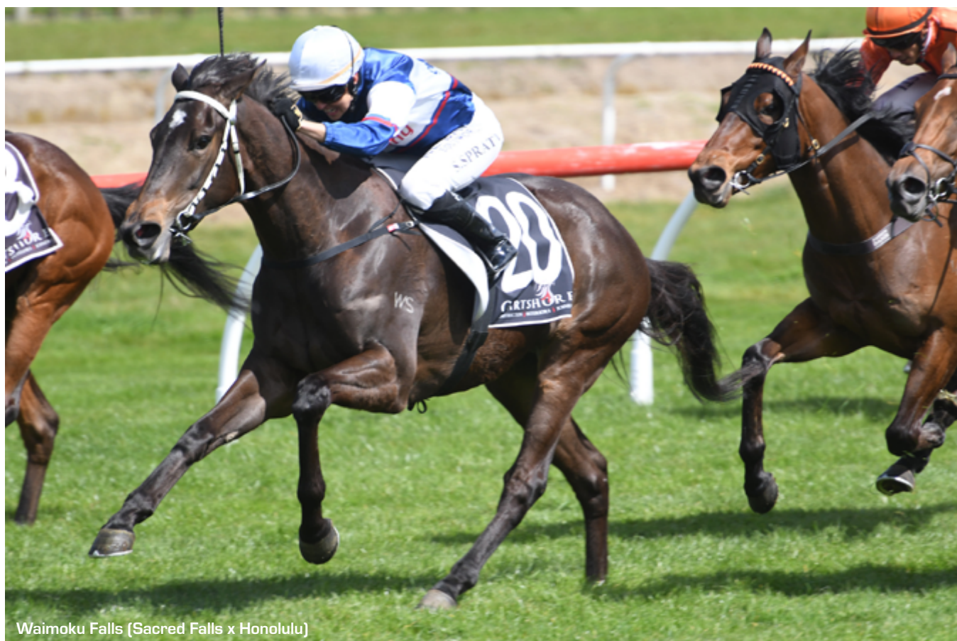
Waimoku Falls (Sacred Falls x Honolulu)

The pedigree page also features Daffodil and Good Faith, who produced the G3 McNeil S. winner Tully Dane.