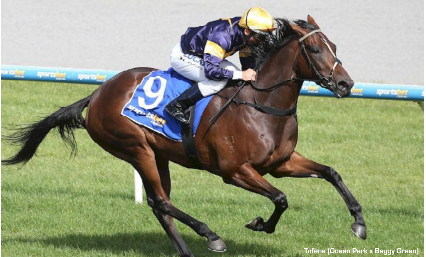
Tofane (Ocean Park x Baggy Green)

Tofane has earned herself a crack at the world's richest race on turf