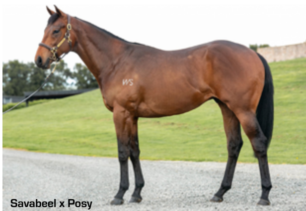
Savabeel x Posy

This colt is a full brother to two-time winner Hurricane Fighter, and stakes-placed 3YO filly Atishu.