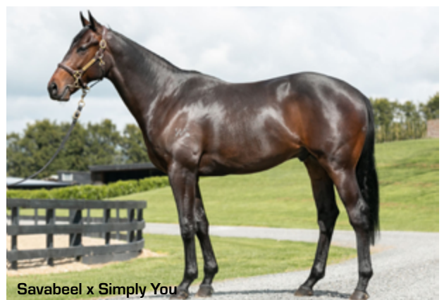
Savabeel x Simply You

A brown colt by Savabeel, the sire of over 100 stakes winners, including 20 Group 1 winners. This colt is out of the sprint winning O'Reilly mare Simply You, who is a three-quarter sister to Group 2 Stan Fox Stakes winner Rare Insight. Rare Insight is the dam of Group 1 Coolmore Classic winner Steps In Time. The grand-dam of this colt is dual Group 1 winner Glamour Puss.