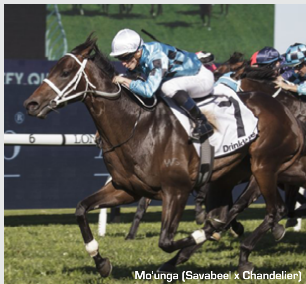
Mo'unga (Savabeel x Chandelier)

She is a sister to the G2 Auckland Thoroughbred Breeders' Stakes winner Irlanda and the family of the G1 Auckland Cup winner Chenille and the G2 Rich Hill Mile winner Chintz, whose son Not An Option was successful in last season's G2 Wakefield Challenge Stakes.