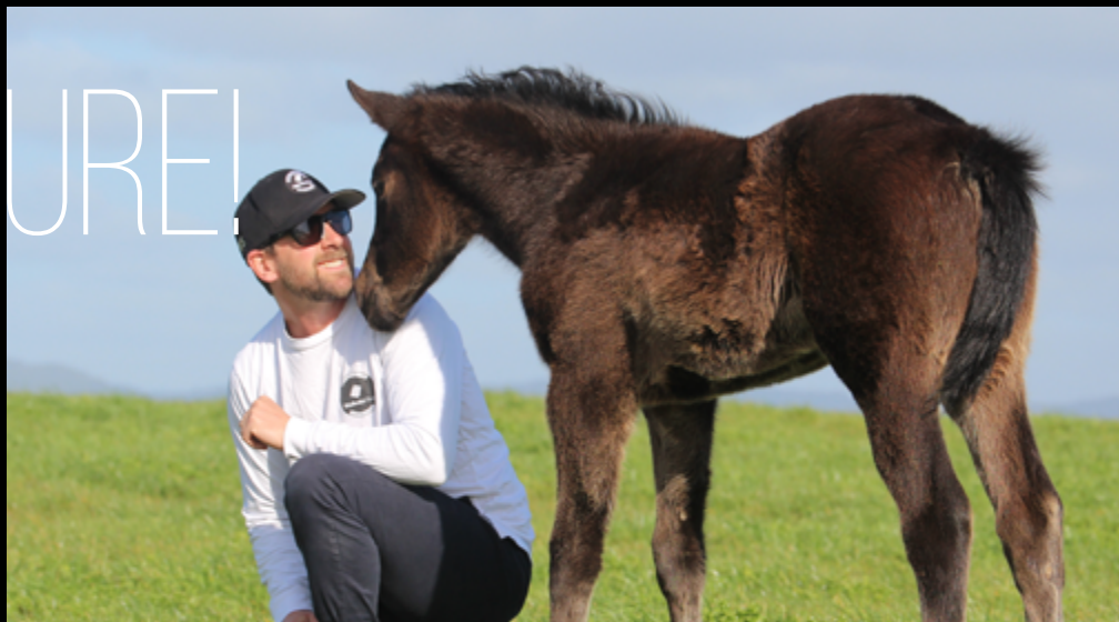
Ardrossan x Elfin – This colt is the first produce out of Elfin and is from a good winning family.