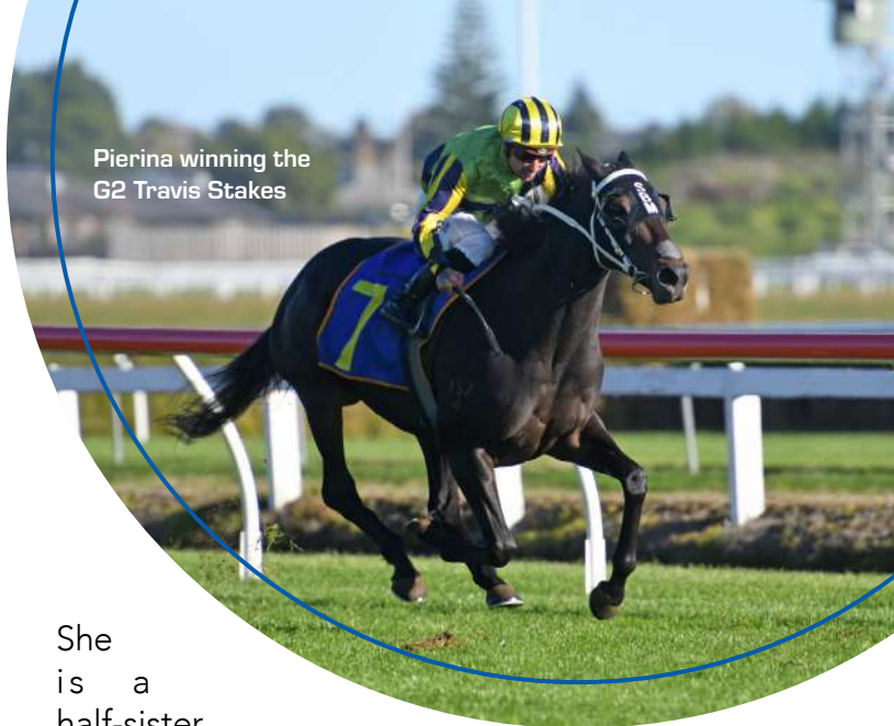
Pierina winning the G2 Travis Stakes

She is a half-sister to the Group 3 winners Spurtonic and Carnegie House while stakes winners and Group 1 performers Frolic, Bam's On Fire and Shovhog all feature in the first two generations of this pedigree.