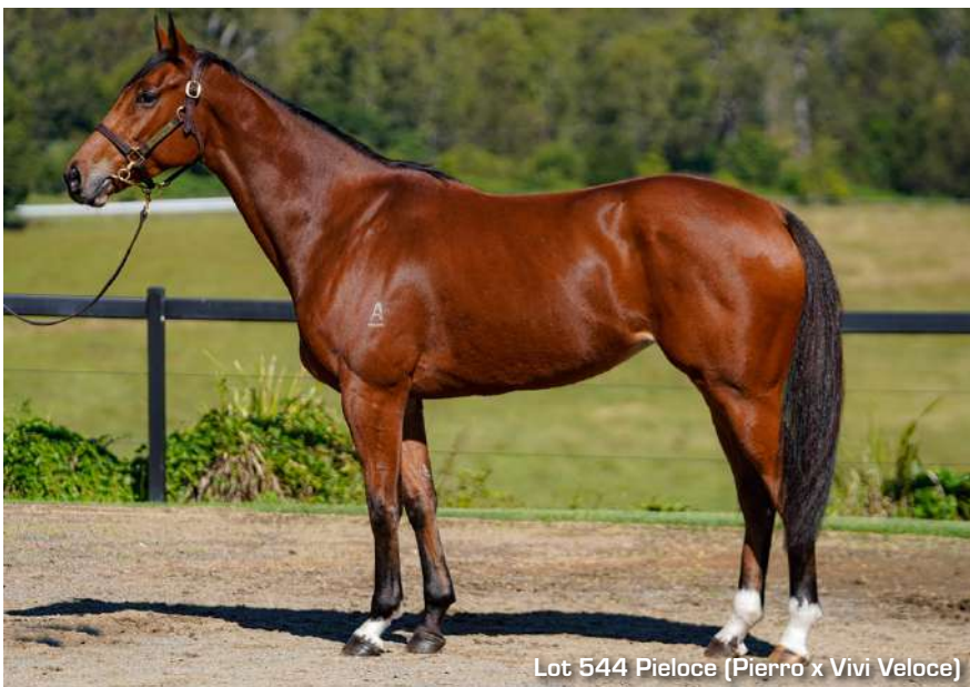
Lot 544 Pieloce (Pierro x Vivi Veloce)

Lot 615, the three-time winner Vinaceous, was bought out of Gooree Park Stud's draft for AU$30,000 and is a daughter of the O'Reilly mare Vilifye, who won four races including the G2 Japan-New Zealand International Trophy and is a half-sister to the G1 Queensland Oaks winner Miss Keepsake.