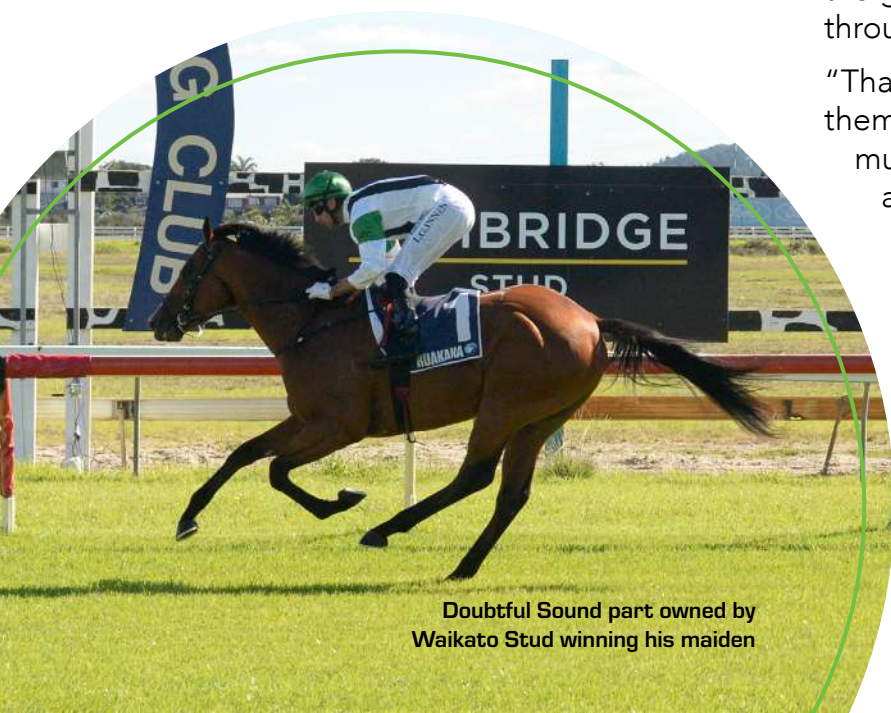
Doubtful Sound part owned by Waikato Stud winning his maiden