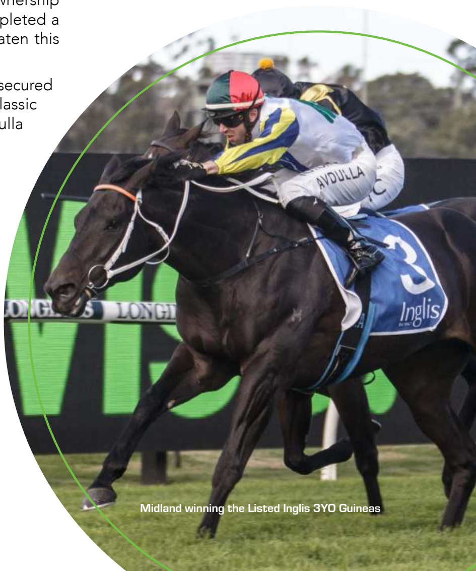
Midland winning the Listed Inglis 3YO Guineas

Midland has compiled a tidy record so far with four wins and three placings from his nine appearances.