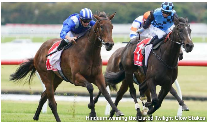
Hindaam winning the Listed Twilight Glow Stakes

Missybeel was originally bought at the Inglis Australian Easter Yearling Sale for AU$260,000 by trainer