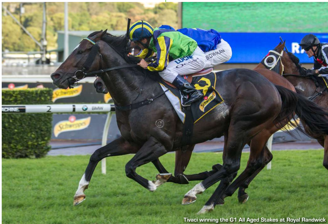
Tivaci winning the G1 All Aged Stakes at Royal Randwick

This is headlined by So You Think, who had 430 4YO runners compared on only 157 2YOs and whose daughter Realm Of Flowers only first hit the track as a 3YO and is now a Melbourne Cup contender.