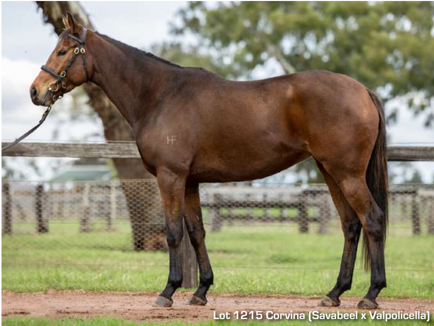
Lot 1215 Corvina (Savabeel x Valpolicella)

Waikato Stud was also in the market for a trio of mares and two of them by Savabeel – Lot 1215 and 615 with the former, Corvina, its top-priced acquisition at AU$320,000.