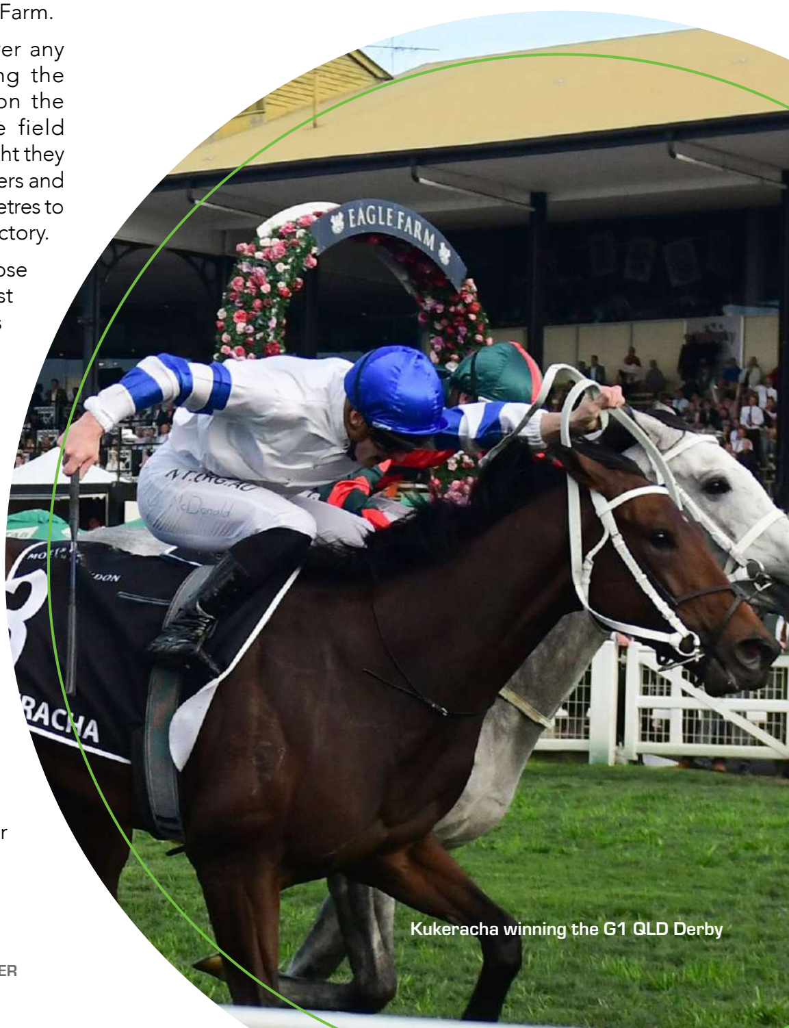
Kukeracha winning the G1 QLD Derby

"His runs in the Guineas and the Rough Habit were both very good and today he was fantastic."