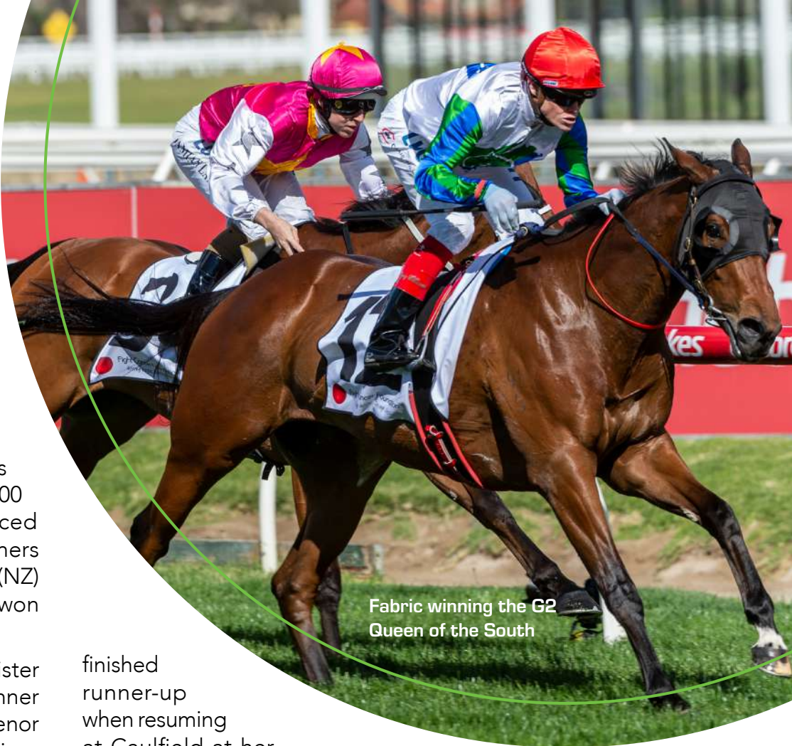
Fabric winning the G2 Queen of the South

"It's great for Waikato Stud and she's a very valuable broodmare prospect now."