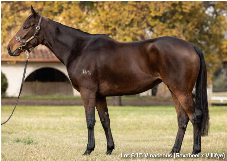
Lot 615 Vinaceous (Savabeel x Villifye)

Waikato Stud was also in the market for a trio of mares and two of them by Savabeel – Lot 1215 and 615 with the former, Corvina, its top-priced acquisition at AU$320,000.