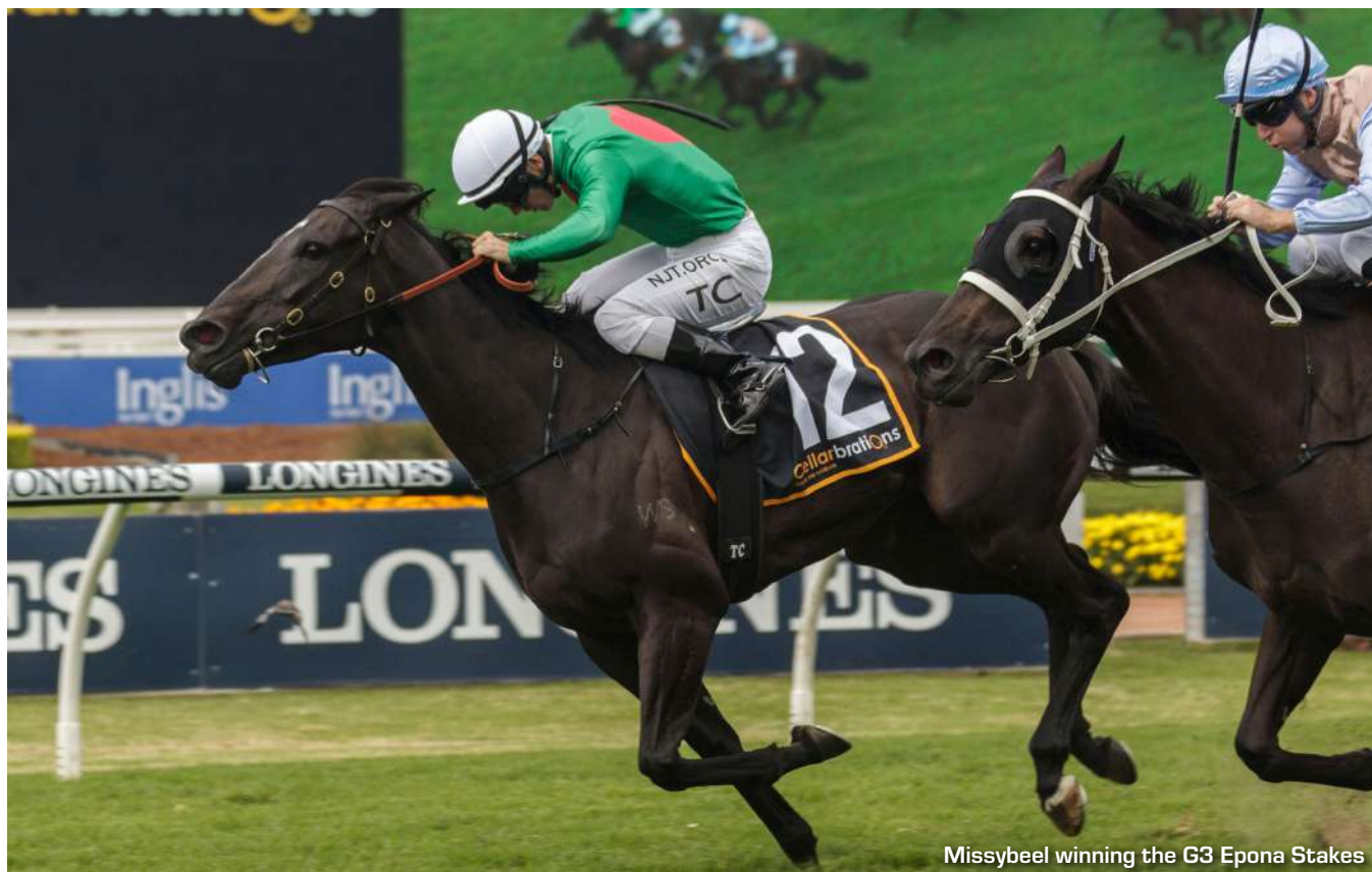
Missybeel winning the G3 Epona Stakes

a yearling price, but he's a colt that is clearly a standout, out of a good mare and by the right stallion in I Am Invincible.