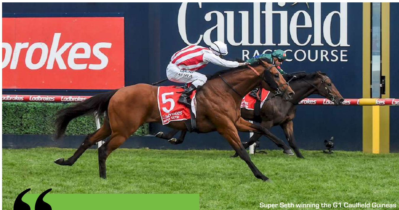
Super Seth winning the G1 Caulfield Guineas